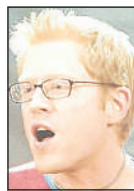
Anthony Rapp Broadway star of "Rent"

"I think audiences will be really surprised not only at the caliber of the guest skaters, but by