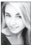
Catherine Blades Actress